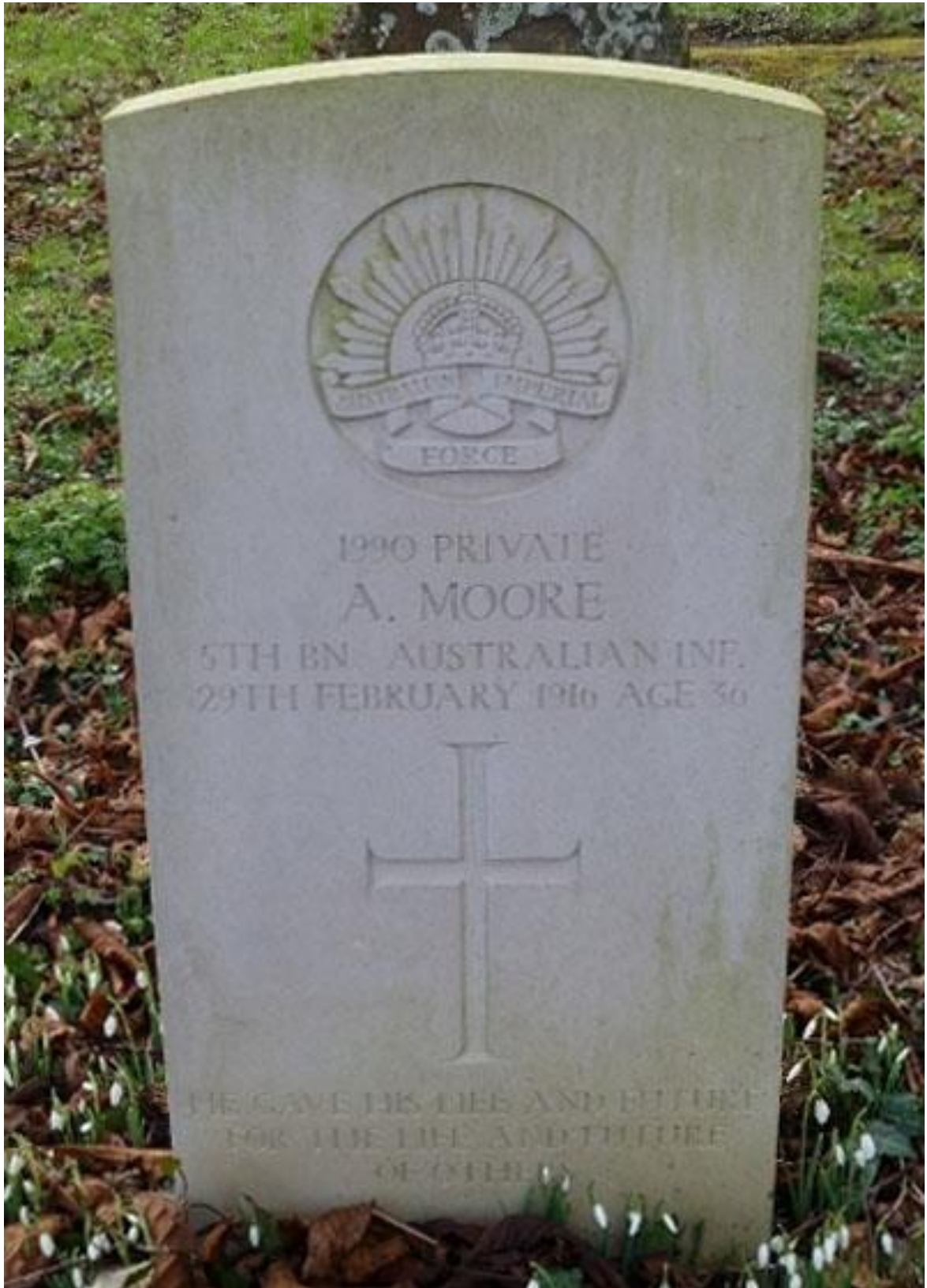
Photo of Private A. Moore's Commonwealth War Graves Commission Headstone in Holy Trinity Churchyard, Chantry, Somerset, England.