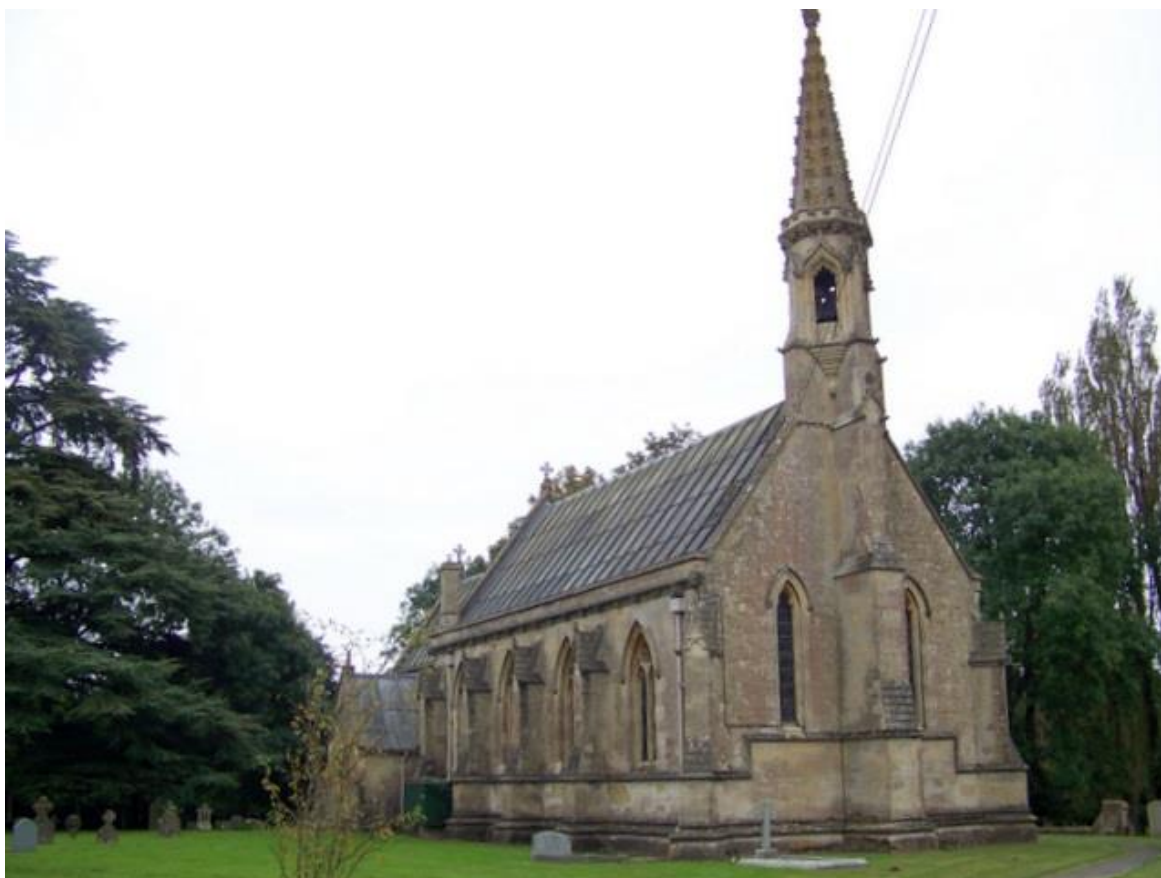
Holy Trinity Church, Chantry

Holy Trinity Churchyard, Chantry contains just one Commonwealth War Grave.